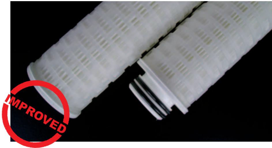
Absolute filter cartridges

The manufacturing of the Twin Filter absolute (standard 65.5mm) cartridge has undergone a rigorous change. Now the fully thermal welded construction ensures safe usage in filtration with high temperature fluids, acids, diesel, oily water and solvents. Furthermore our cartridge now has a firm outer-guard making it much stronger. The TH absolute rated filter cartridge is manufactured under high quality standards in our production facilities in the Netherlands. This high performance and cost effective pleated cartridge is especially manufactured for filtration of oilfield fluids. The TH cartridges assure the removal of particles in the size range, necessary to protect the formation. The pleated absolute cartridges have a diameter of 2 1/2" (65.5mm), and the 6 5/8" (168.28mm) high flow Magnum cartridge.