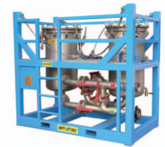
Duplex cartridge filter unit

The Duplex cartridge filter unit is the most commonly used cartridge filter unit in the oilfield industry. This offshore proof, skid-mounted filter unit is equipped with all necessary valves and safety features. The Duplex offers the most cost effective way to clean-up all possible oilfield fluids. It allows you to simultaneously filter with one vessel, and easily change out the used cartridges of the other vessel.